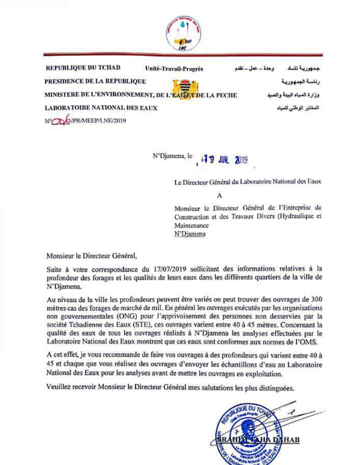
Figure 2. This letter comes from the National Water Laboratory of the Republic of Chad. Translated, it outlines the procedure for building water wells in rural areas of Chad. In these areas, the Lab recommends that the well depth be between at least 40-45 meters as conforming to standards that all NGOs are held to.

Our initial proposal for a well depth of 45 meters comes from a letter written by the National Water Laboratory run by the Ministry of the Environment in the Chad Republic. According to the letter we received from the ministry, "For this purpose, I recommend you to do your work at depths that vary between 40 and 45 and each time you carry out works". This is in accordance with World Health Organization (WHO) standards as well as Chad's National Water Laboratory for projects carried out by NGOs. Additionally, Embrace Relief always performs water quality testing at new sites as outlined in this letter by the laboratory director.